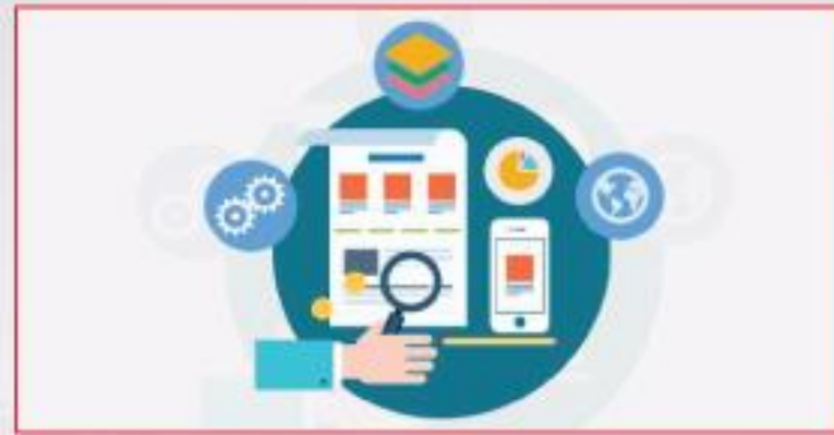
Online Sales Management