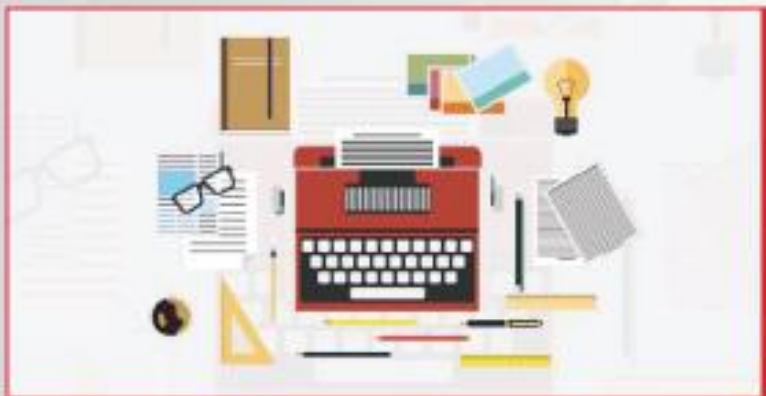
Business Logic Development

We deliver high quality work at low cost; we'll deliver on time, within budget and always exceeding your expectations.