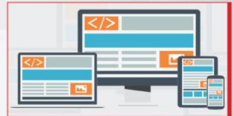
Web Design and Development